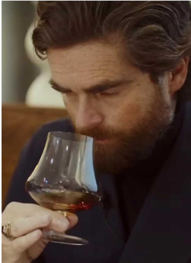
Cognac & Champagne tasting