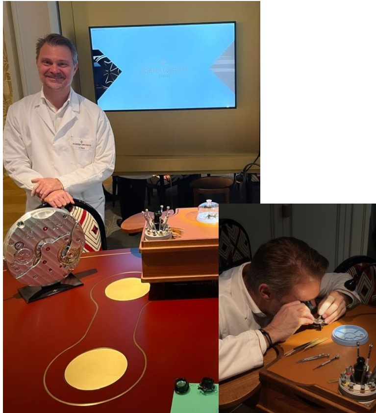
Vacheron Constantin Masterclass